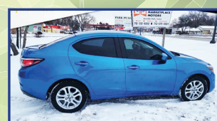
2016 SCION IA Blue, Black Interior, FWD 33MPG City/42 MPG HWY $11,900