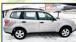
2011 SUBARU FORESTER 2.5X Gray, AWD, 27 MPG 99K Miles $10,920