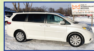
2012 TOYOTA SIENNA LIMITED White, Gray Interior, AWD, 7 Pass $11,400