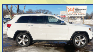
2015 JEEP GRAND CHEROKEE LIMITED White, LOADED, 4x4, 24 MPG HWY $14,250

1997 Jeep Wrangler, 4WD, 2.5L 4 Cyl, 147K Miles, Removable Hardtop, Upgraded Rims & Tires, $9,888