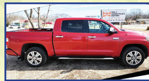
2014 TOYOTA TUNDRA PLATINUM Red, Black Interior, 4x4, Crewmax, 5.7L V8. $20,725