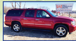
2013 CHEVROLET SUBURBAN LTZ Red, Black Interior, 4X4, 5.3 L V8 $13,9755