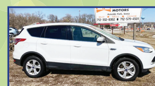
2015 FORD ESCAPE SE White, AWD, 104K Miles, 29 MPG HWY $11,995