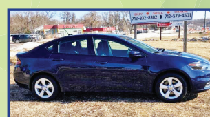
2016 DODGE DART SXT Blue, Black Interior, 35K Miles FWD, 35 MPG HWY $14,475